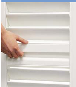
Exclusive Divider Rail

Streamline integrated handle to open and close.