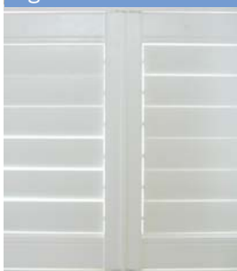
Light Block & Interlock

Covers unwanted light gaps between panels.