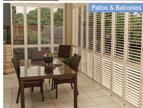
Patios & Balconies