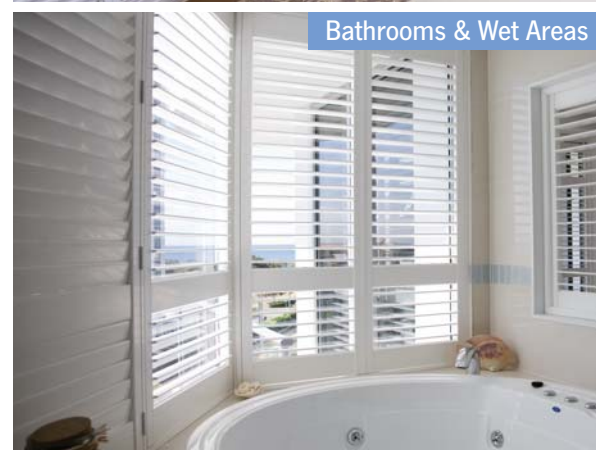
Bathrooms & Wet Areas